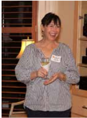
Waverly - TDW Chair