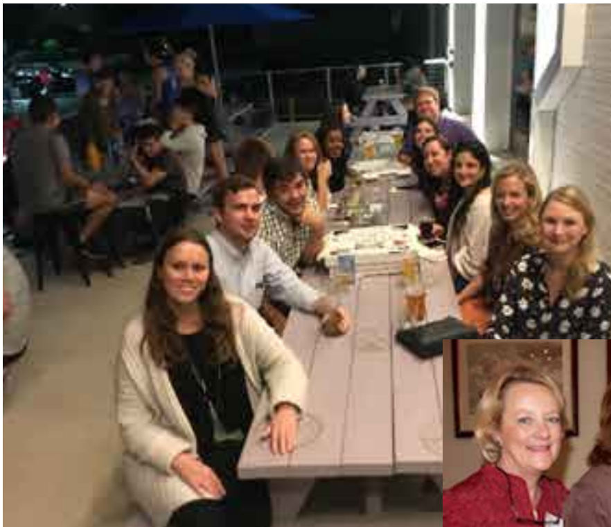
Young Theta Alumnae with Fijis at Happy Hour