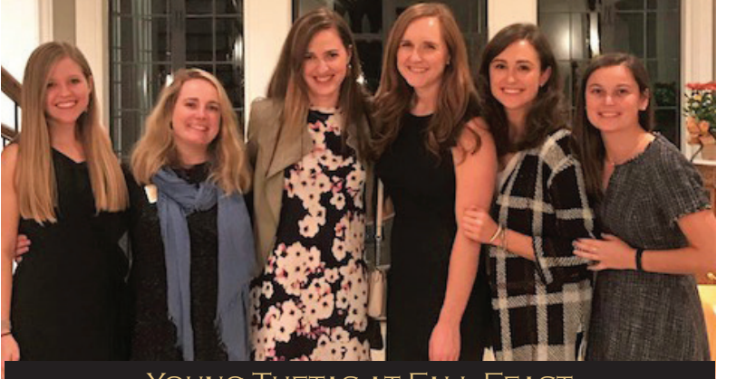
YOUNG THETAS AT FALL FEAST