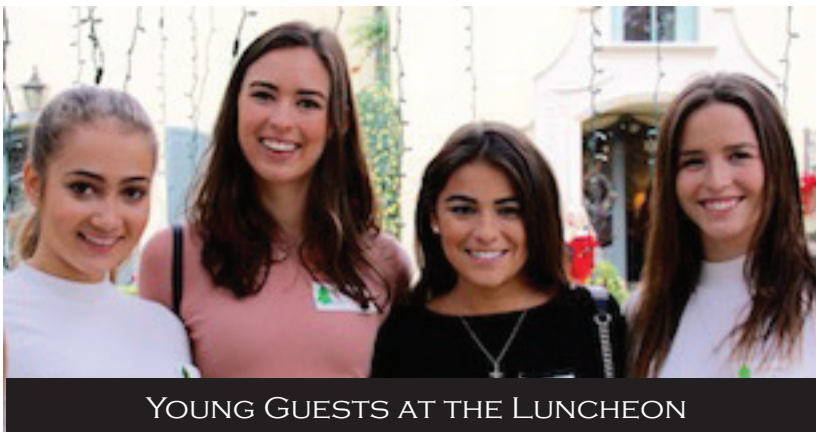
YOUNG GUESTS AT THE LUNCHEON