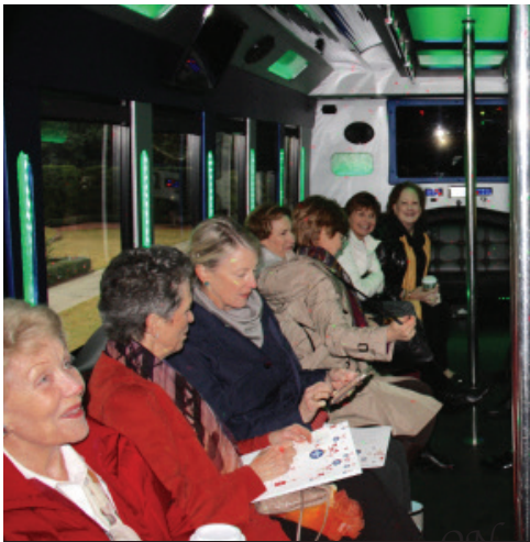
TRAVELERS ON THE BUS