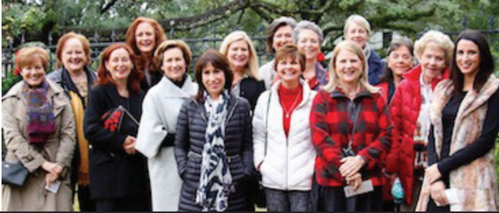
THETAS ON THE PILGRIMAGE