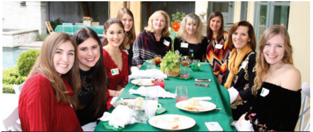
GUESTS ENJOYING THE CHRISTMAS LUNCHEON