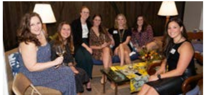
Nite Kites having a fun evening