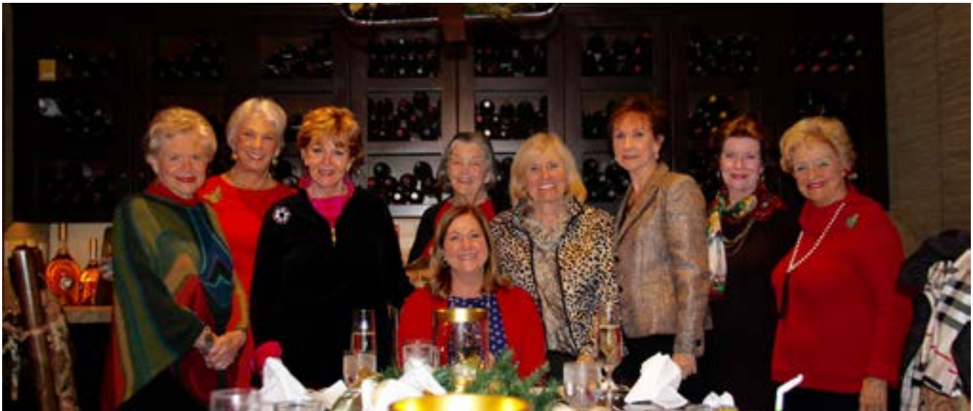
THETA WILDKATS CHRISTMAS LUNCH